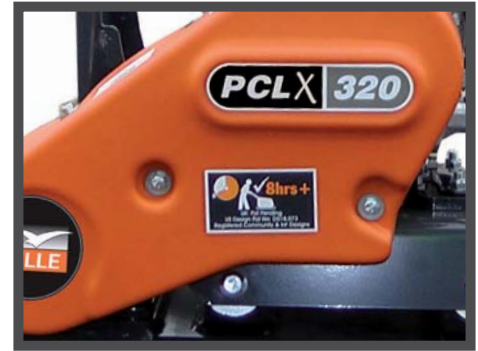
BHRS+ SAFE MACHINE