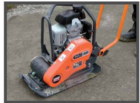
'DUAL FORCE' BASEPLATE FROM STRENX™ PERFORMANCE STEEL WITH HARDOX® WEAR PLATE